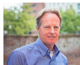
Gregg D. Ander LLC