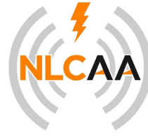
National Lighting Contractors Association of America