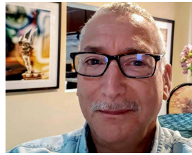
Phil Hall Images & Light